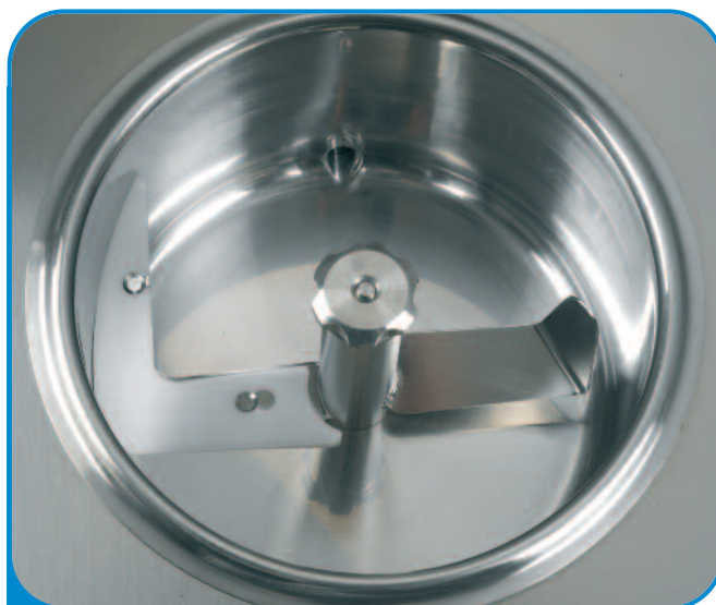
● G10 cylinder and beater detailed view